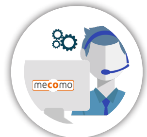
Focus on Service & Support