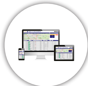
Powerful Telematics Platform